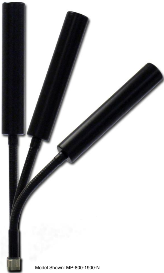
Model Shown: MP-800-1900-N