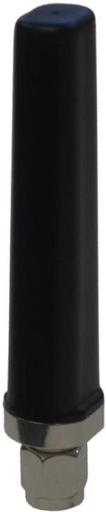
Model Shown: SA-4400-5900