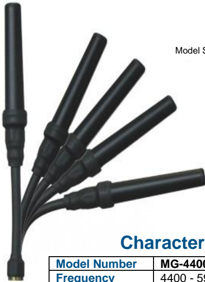
Model Shown: MG-4400-5900