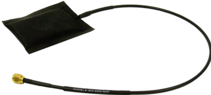
Model Shown: BW-5200-5900