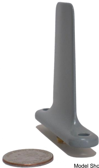
Model Shown: AU-1600-4400