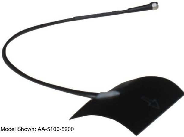
Model Shown: AA-5100-5900