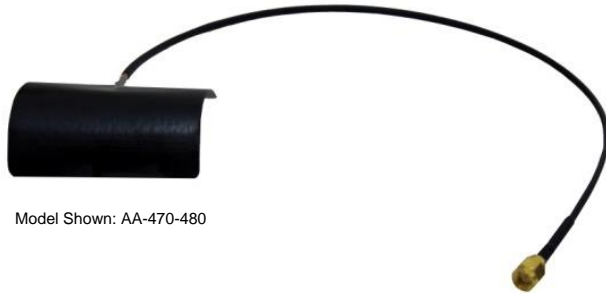
Model Shown: AA-470-480