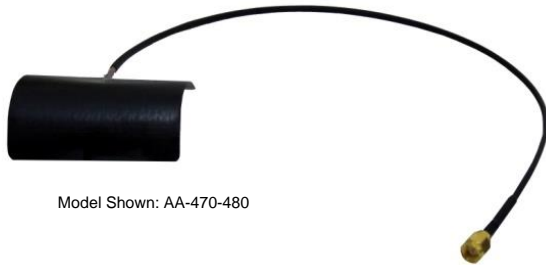
Model Shown: AA-470-480