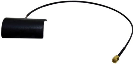
Model Shown: AA-420-450