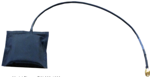
Model Shown: BW-900-1000